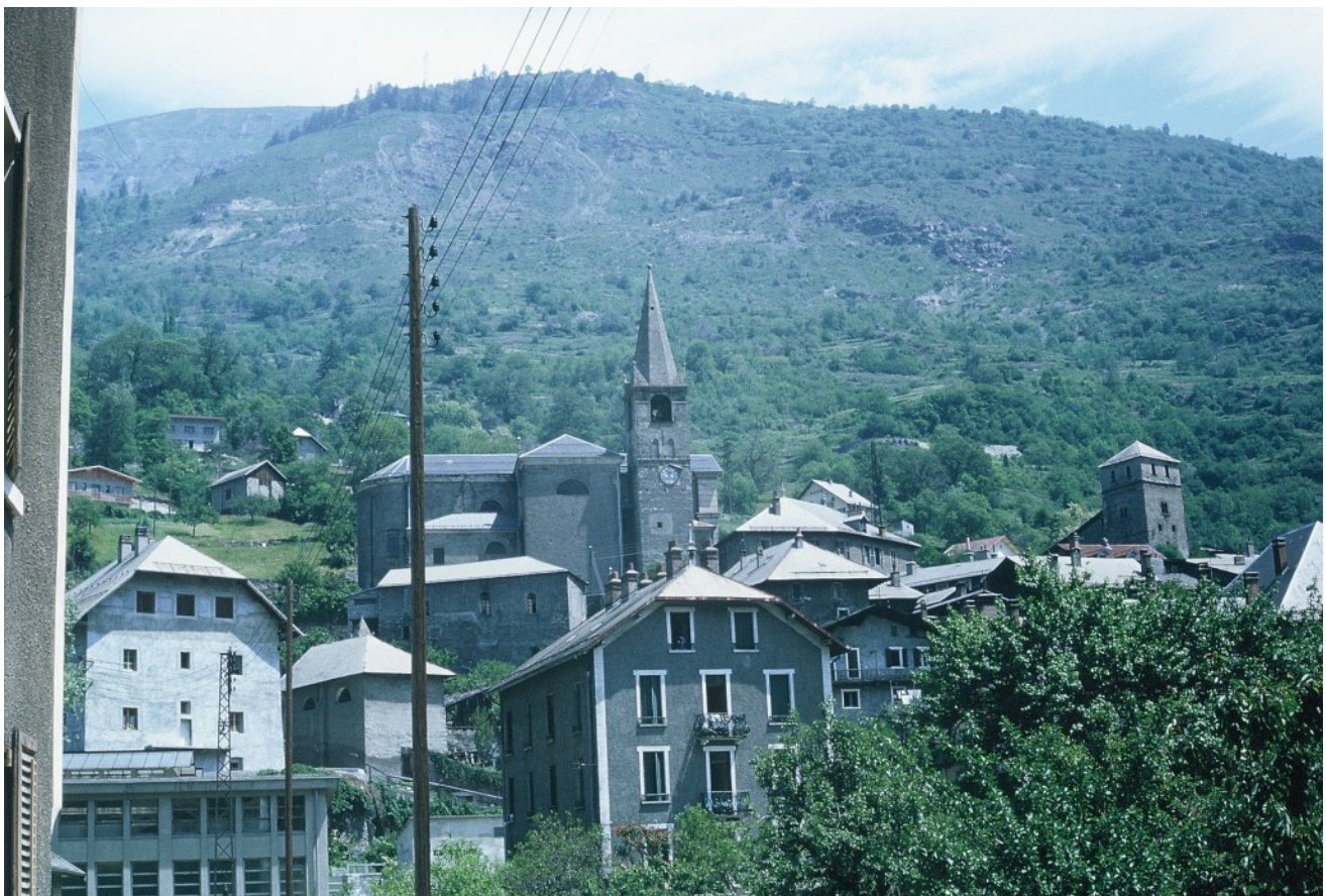
A view of St. Michel de Maurienne.

Before I left for France, I recovered some snapshots from the summer of '61 that I wanted to share with those I worked with. I gave him several photos of the village I had taken AND, more importantly, photos I had taken of his family. It turned out that he was the 1-year old in his mother's arms in the photo. It was an amazing moment for both of us. For me, I had closed a circle by coming back to the site of the foundry and for him, it was a chance to see a friend of his parents from decades ago. I imagine I was the only American to ever have spent a summer in its steel mill or maybe even in St. Michel de Maurienne.